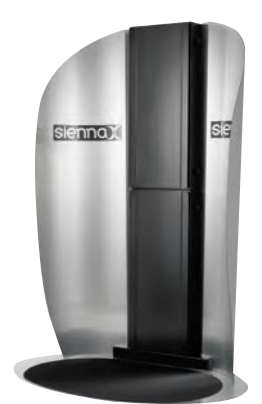
* Must have complied with manufacturers' guidelines