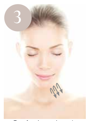
Top of neck scooping up to beneath chin - use jaw as anchor