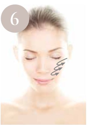
Glide inwards across cheek. Scoop outwards towards temple