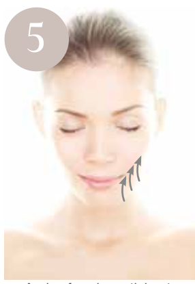
Anchor from beneath jaw to beneath cheek bone