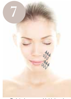
Twist along nasal labial and marionette