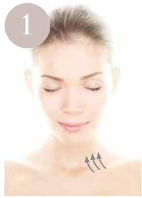
Base of neck scooping up to mid