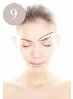
Glide over brow and scoop outwards up towards temple