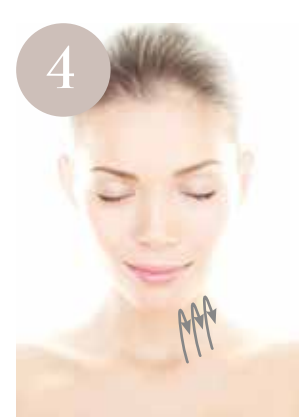
Full neck sweep and anchor from base of neck to jaw