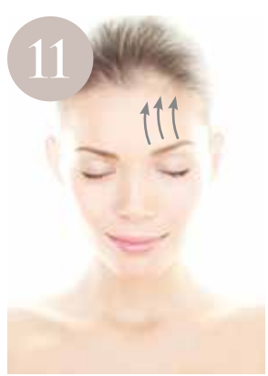
Brow lifting - from beneath brow pulling to above brow