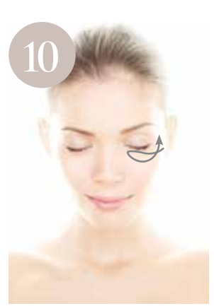
Gently gilde under eye and scoop and lift outward to temple