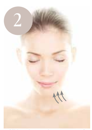
Mid neck scooping up to top of neck